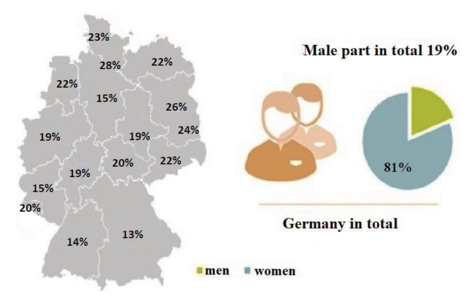
Figure 2. Students of the first year ofteachers school with gender differentiation in 2017\mbox{-}2018 (in %)

recruiting interested parties interested in changing their profession were to be created in all federal states from March 2015<sup>9</sup>. It is worth adding that the continuing coordination office "MEHR Männer in Kitas" accompanies this program both in scientific and practical dimensions (Ibidem). The aim of the "Quereinstieg—Männer und Frauen in Kitas" program is therefore to implement adult-friendly, part-time education enabling the acquisition of state qualifications to practice the profession while receiving a salary. This model enablesremuneration for internships completed during retraining. This way of delivering education is already bringing some results as statistics confirm the increase in the number of male pedagogical staff at the preschool educational level.